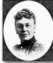
Augusta Pierce Tabor (1833-1895)

Based on the lives of actual historical figures Horace Tabor, Elizabeth "Baby" Doe Tabor and Augusta Tabor, the opera tracks their lives from Horace and Baby Doe's meeting to the death of Horace. "Always Through the Changing" is a post-script ending foretelling Baby's death.