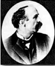
Horace Austin Warner Tabor (1830-1899)