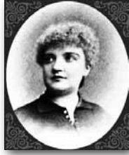
Elizabeth Bonduel Mccourt "Baby" Doe Tabor (1854-1935)